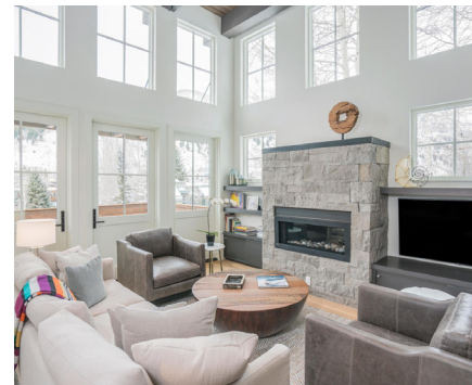
BEAR CREEK RESERVE