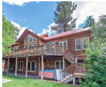
RED CLIFF ESTATES