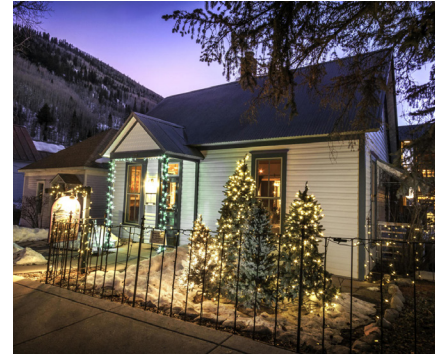
221 S OAK